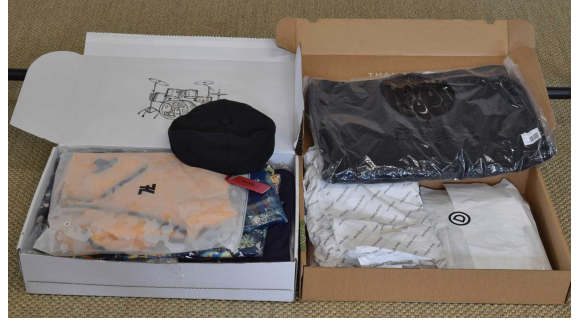
TWO BOXES OF UNOPENED AND UNWRAPPED GENTS DESIGNER CLOTHING, Two boxes of unopened and unwrapped gents designer clothing, to include Pretty Green, Desigual, Replay, etc. £40-60