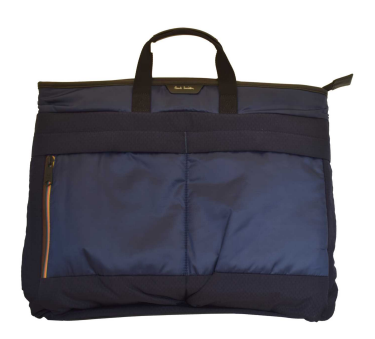
A PAUL SMITH BAG/RUCKSACK, A Paul Smith bag/rucksack, the blue canvas exterior with maker's logo and stripe detailing, zip top fastening, top handles and rucksack straps, dimensions 48 x 40 x 9cm. With maker's dust bag. £30-50