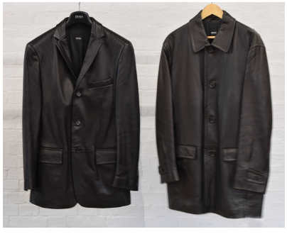
TWO BOSS LEATHER JACKETS, Two Boss leather jackets, (2) £60-90