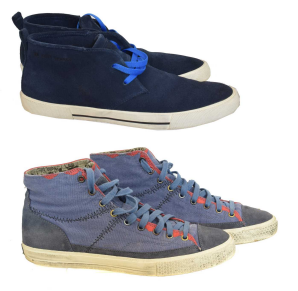
TWO PAIRS OF HUGO BOSS SHOES, Two pairs of Hugo Boss shoes, to include 'Trewave' trainers in bright blue, and 'Santaro' boots in navy, size UK 9, with maker's boxes. £40-60