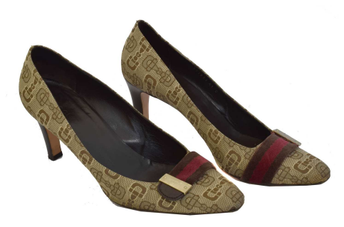
A PAIR OF GUCCI HEELS, A pair of Gucci heels, monogrammed with maker's ribbon and gold tone detailing, size 41C. £40-60