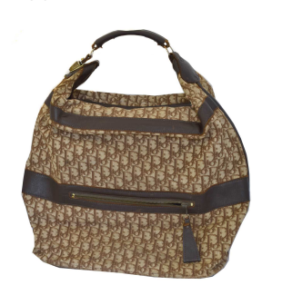
Buyer's Premium of 25% +VAT on each lot