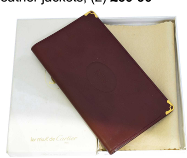
A MUST DE CARTIER 'BORDEAUX' WALLET, A Must De Cartier 'Bordeaux' wallet, the maker's burgundy leather exterior with embossed logo detailing and gold tone hardware, dimensions 19 x 10.5cm. With maker's pouch and box. (Dimensions: 19 x 10.5cm) £20-40