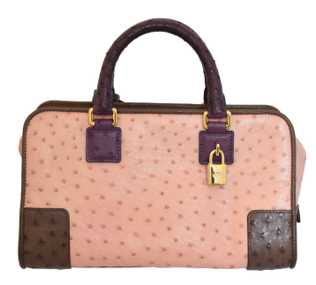
A LOEWE 'AMAZONA' HANDBAG, A Loewe 'Amazona' handbag, the pink, purple and brown ostrich leather exterior with swing handles, gold tone hardware, padlock and zip fastening, to the pink smooth leather interior with pink ostrich leather card holder, no. 111203, dimensions 29 x 12.5 x 17cm. £200-400