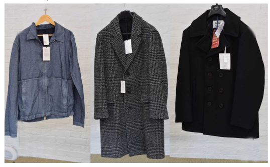
THREE GENTS DESIGNER JACKETS, Three gents designer jackets, to include a Mr Porter jacket with tags, a Mr Porter wool coat with tags, and a Schott wool pea coat with tags, sizes XL, L and 44 (3) £30-50