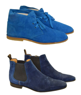
TWO PAIRS OF PAUL SMITH BOOTS, Two pairs of Paul Smith boots, to include a pair of 'Falconer' boots, in Azur blue, together with a pair of 'Norman' boots in Cobalt blue, size UK 9, with maker's box. £40-60