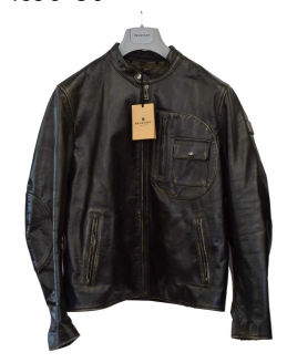
A BELSTAFF LEATHER JACKET, A Belstaff leather jacket, size 44, with tags attached. £60-120