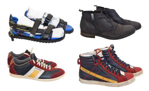
FOUR PAIRS OF DIESEL SHOES, Four pairs of Diesel shoes, to include a pair of 'Vintagy Lounge' trainers, a pair of 'String' trainers, a pair of sandals, and a pair of boots, size UK 9 and 9.5, with maker's boxes. £40-60