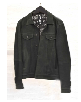
A GREEN SUEDE REPLAY JACKET, A green suede Replay jacket, size XXL. £20-40