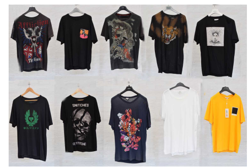
TEN DESIGNER GENTS T-SHIRTS, Ten designer gents t-shirts, to include Belstaff, Lacoste, etc. £20-40