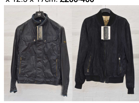
TWO MATCHLESS JACKETS, Two Matchless jackets, to include a black suede bomber jacket size XXL, and a black wax jacket size XXL, both with tags (2). £20-40