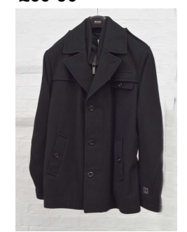
A BOSS ORANGE BLACK WOOL COAT, A Boss Orange black wool coat, with wool collar, size L. £50-100