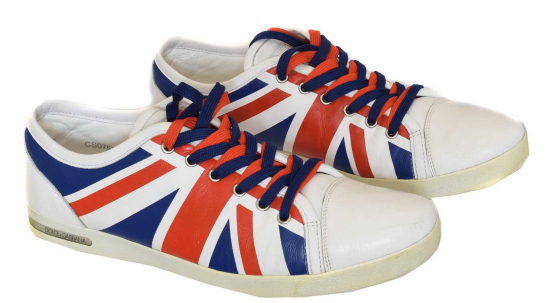
A PAIR OF DOLCE & GABBANA 'PIOMUTTO ST. BANDIERA' TRAINERS, A pair of Dolce & Gabbana 'Piomutto St. Bandiera' trainers, with Union Jack decoration, UK size 9, with maker's box and dustbags. £30-50