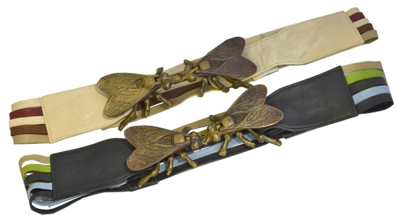
TWO BELTS BY TSEKLENIS, Two belts by Tseklenis, each with bug terminals, and additional leather belt attachments, lengths 93 and 95cm (2). £40-60