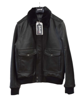
A SCHOTT LEATHER BOMBER JACKET, A Schott leather bomber jacket, size XL, with tags attached. £50-80