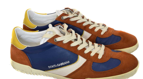
A PAIR OF DOLCE & GABBANA 'BLUETTE' TRAINERS, A pair of Dolce & Gabbana 'Bluette' trainers, ref. CS1123, size 9, with maker's dustbags and box. £30-50