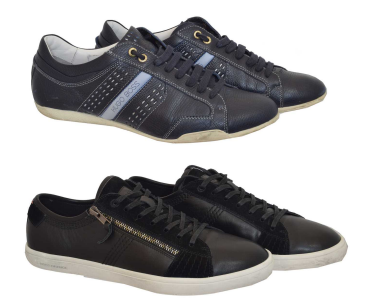
TWO PAIRS OF HUGO BOSS TRAINERS, Two pairs of Hugo Boss trainers, 'Soundy' in black, and 'Suberb' in dark blue, size UK 9, with maker's boxes. £40-60