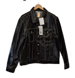
AN EYTYS PATENT LEATHER JACKET, An Eytys patent leather jacket, cream stitching, size women XL, men L, with tags attached. £50-100