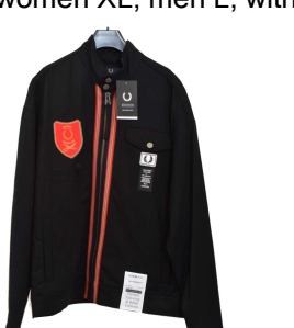
A FRED PERRY 'ART COMES FIRST' JACKET, A Fred Perry 'Art Comes First' jacket, black, with red/orange detailing, size M, with labels attached, £50-80