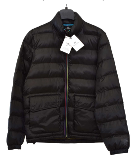
A PAUL SMITH PUFFER COAT, A Paul Smith puffer coat, size S, with tags attached. £40-60