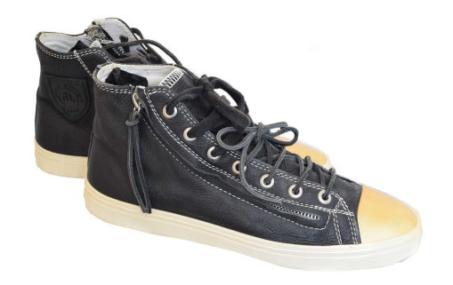
A PAIR OF SAINT LAURENT 'MID TOP' TRAINERS, A pair of Saint Laurent 'Mid Top' trainers, black leather with a cream trim, size UK 9, with makers dust bag and box. £30-50