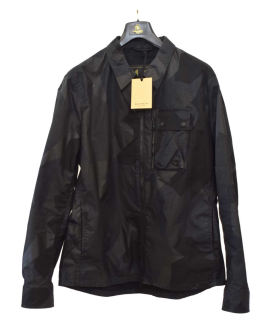
A BELSTAFF CAMO WAX JACKET, A Belstaff camo wax jacket, size M, with tags attached. £50-80