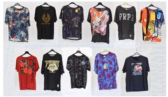
ELEVEN GENTS DESIGNER T-SHIRTS Eleven gents designer t-shirts £20-40