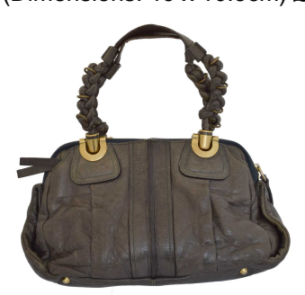
A CHLOE HELOISE HANDBAG, A Chloe Heloise handbag, the green leather exterior with gold tone hardware, braided handles and zip top fastening, dimensions 37.5 x 25 x 13cm. £150-250