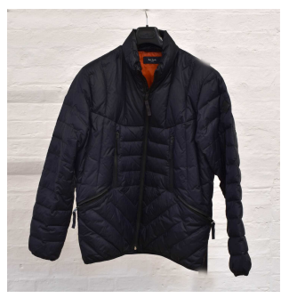
A PAUL SMITH PUFFA JACKET, A Paul Smith puffa jacket, black, size L. £30-50